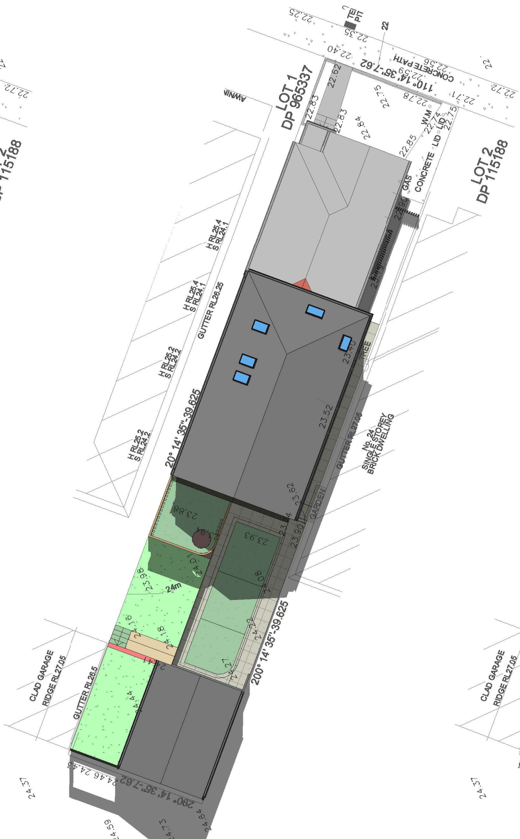
2 21st MARCH/SEPT 12pm 1 : 200